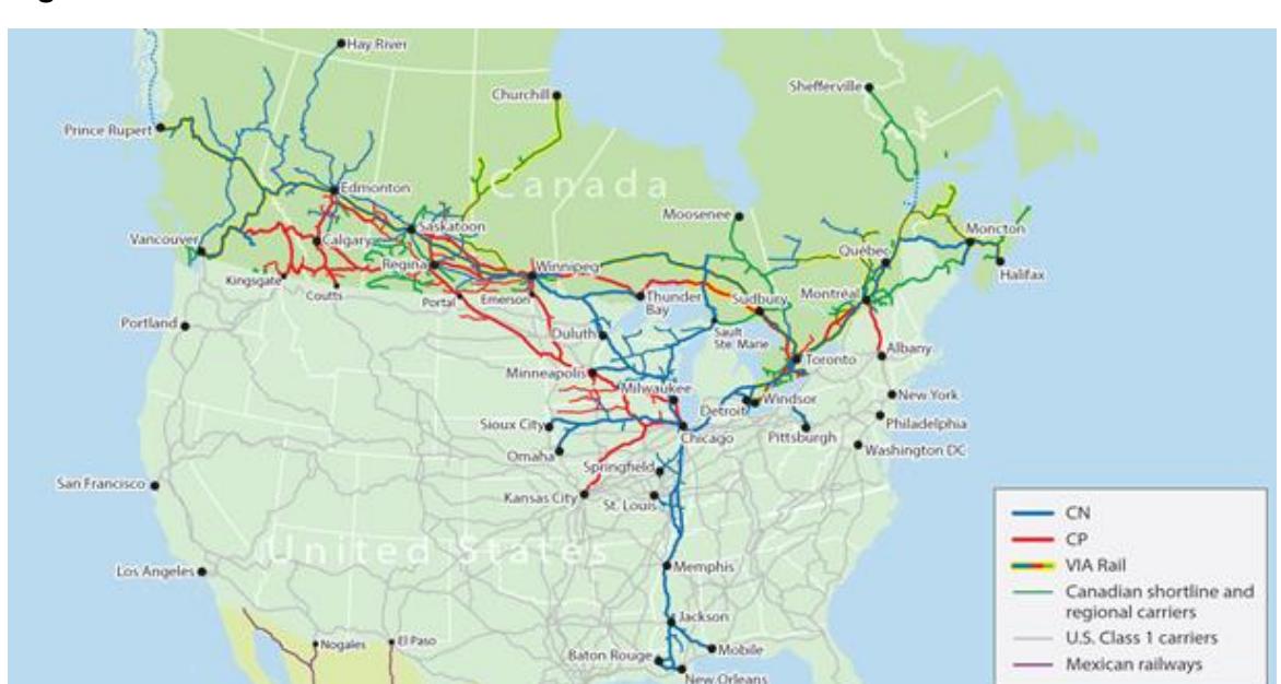
Figure 2: Canada's rail franchise

Railways are among the lowest industrial emitters in Canada, accounting for just 1% of GHG emissions. Despite rising ridership and increasing demand, railways continue to achieve emissions reductions. Since 1990, freight railways have reduced their GHG intensity by more than 40%, while experiencing an 80% increase in workload, and intercity passenger railway emissions have decreased by 55%, while ridership has increased by 2%.